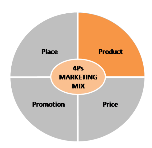
Figure:4 p marketing mix

Organizations must have growth of new items to become and remain aggressive, yet development is dangerous and exorbitant. An incredible dominant part of new items never makes it to the market and those new items that enter the commercial center face high disappointment rates. Careful figures are elusive and differ contingent upon the kind of market (modern versus purchaser) and item (cutting edge versus quick moving customer products). Also, various criteria for the meaning of accomplishment and disappointment make it muddled to think about. Be that as it may, disappointment rates have stayed high over the earlier decades, averaging 40% (Griffin, 1997). As indicated by Crawford (1987), the normal disappointment rate is about 35%. Afterward, Cooper (1993), a main scientist in the field of new item advancement (NPD), gauges a disappointment rate in the request of 25-45%. A later investigation of ACNielsen (2000) demonstrated that only 33% of all quick moving shopper products presented in 1998 in Dutch grocery stores could be viewed as fruitful. In this examination achievement was characterized