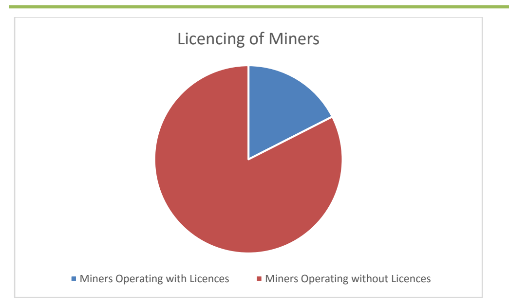
Figure 2: Miners who operate with licences.

International Journal of Advanced Research in Management and Social Sciences