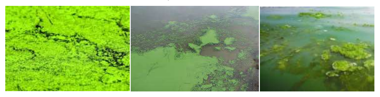
1. Near to Someshwar Temple 2. Near to Chopadalons3) NandurVillege